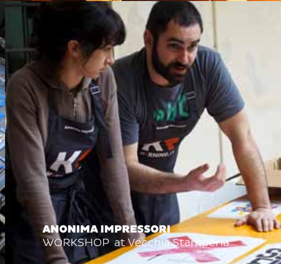
ANONIMA IMPRESSORI WORKSHOP at Vecchia Stamperia