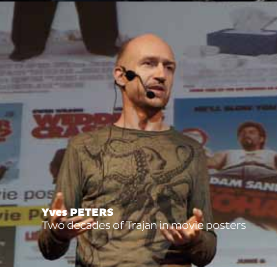
Yves PETERS Two decades of Trajan in movie posters