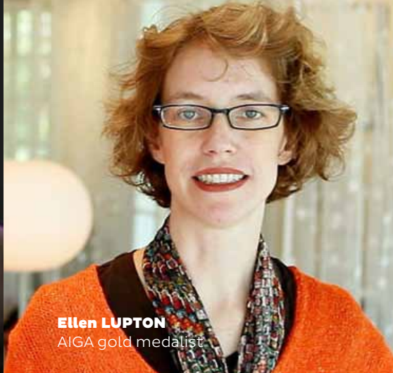
Ellen LUPTON AIGA gold medalist